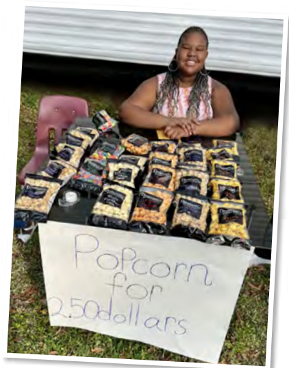
"Selling for that trip!"